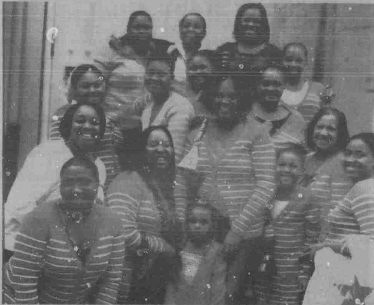
"What a time in Chicago!"