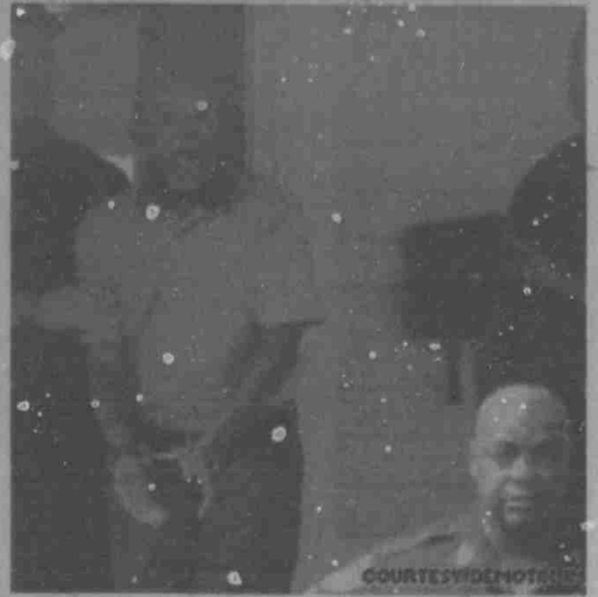
Henry Louis Gates Jr. was arrested last week on a charge of disorderly conduct.

"I can't believe that an individual policeman on the Cambridge police force would treat any African-American male this way, and I am astonished that this happened to me;