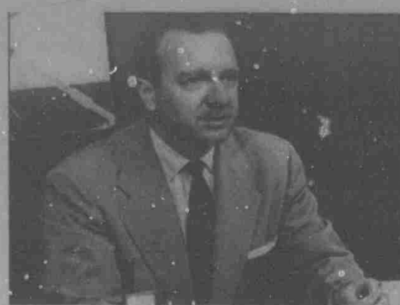
To a younger generation, the very idea of widespread grieving over a TV news anchor may

be hard to fathom, as is the concept of a large part of the population being happy to get their news from just one, generally loved figure. They have no reference point for Walter Cronkite, who died Friday at 92, because his kind, rare enough in his heyday, does not exist anymore.