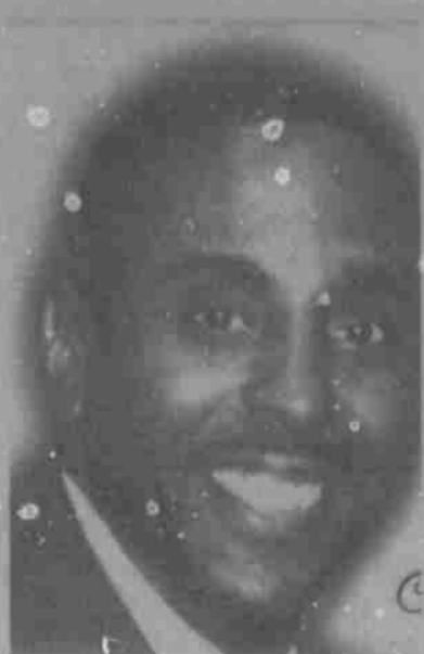
Clark Funeral Home of Dallas.