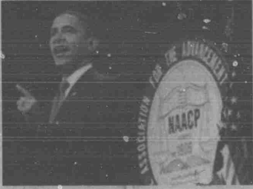
President Barack Obama speaks during the NAACP 100th Anniversary convention in New York on July 16, 2009.

"You know what I'm talking about. There's a reason the story of the civil rights movement was written in our schools. There's a reason Thurgood Marshall took up the cause of Linda Brown. There's a reason the Little Rock Nine defied a governor and a mob," Obama said. "It's because there is no stronger weapon against inequality and no better path to opportunity than an education that can unlock a child's