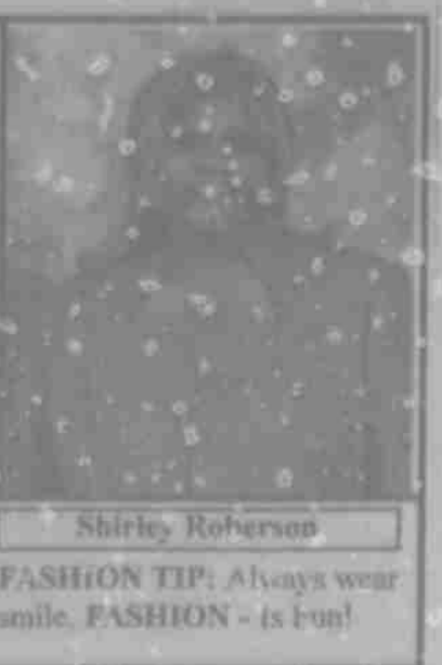
Shirley Roberson FASHION TIP! Always wear smile. FASHION - is fun!

showered with sparkling beads and exquisite embroidered swirls on the pretty jacket. Jacket in a chic, softly draped style has 3/4 length sleeves and covered button closure. Feminine dress in solid purple shantung has a flattering scoop neck, a lined turtleneck for sure! AT YOUR BETTER DEPARTMENT STORE