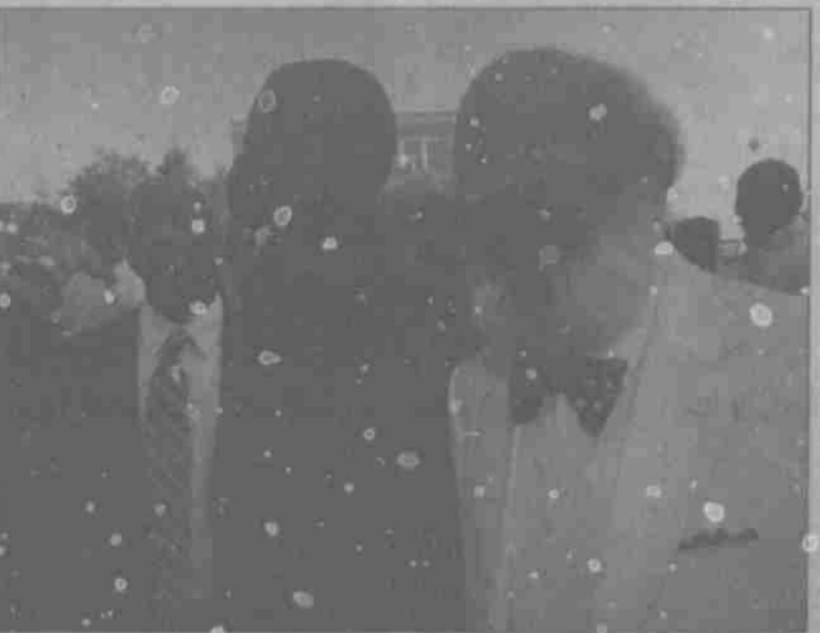
Hundreds attend dedication of civil rights monument at Ole Miss, 44 years after integration. The monument features a life-size bronze likeness of James Meredith, the first black student admitted to the university. The statue is posed as if it is striving toward a 17-foot-tall limestone portal topped with the words "courage," "perseverance," "opportunity" and "knowledge."

Lewis' words captivating and the entire day a historic success.