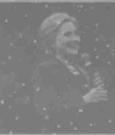
Sen. Hillary Clinton