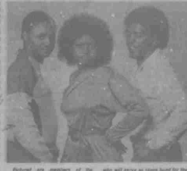
who will easy as plays hard for the Pictured are members of the Playmatte and title Street Playmatte