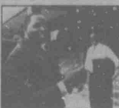
Mayor Kwame Kilpatrick

DETROIT (AP) — A detective working a criminal case against Mayor Kwame Kilpatrick said coincidence led him to a house to try to deliver a subpoena.