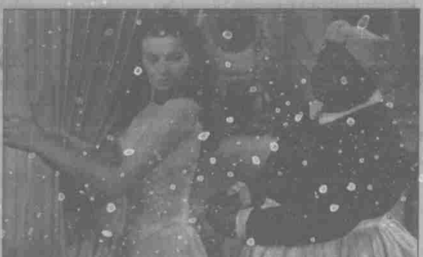
Hattie McDaniel is shown here as "Mammy" in her most famous role in the movie Gone with the Wind . Pictured with her is actress Vivien Leigh, who played Scarlett O'Hara.