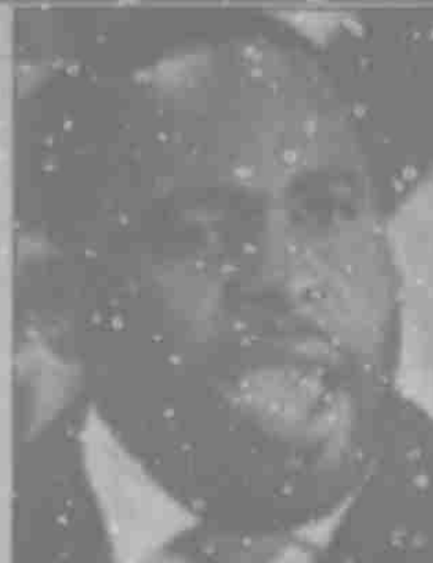
Mayor Kwame Kilpatrick

Regarding his wife, he said, "Our marriage has not been perfect, but it has been great. Now