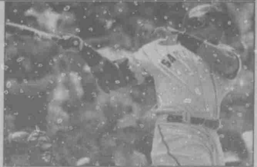
Barry Bonds now faces 15 charges in Tuesday's revised indictment for perjury.

Barry Bonds, baseball's home run king, is now charged with 14 counts of lying and one count of obstruction in a revised indictment filed Tuesday.