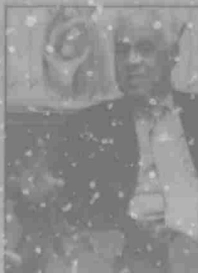
L. Douglas Wilder

He said he never bet on basketball, and only bet in casinos.