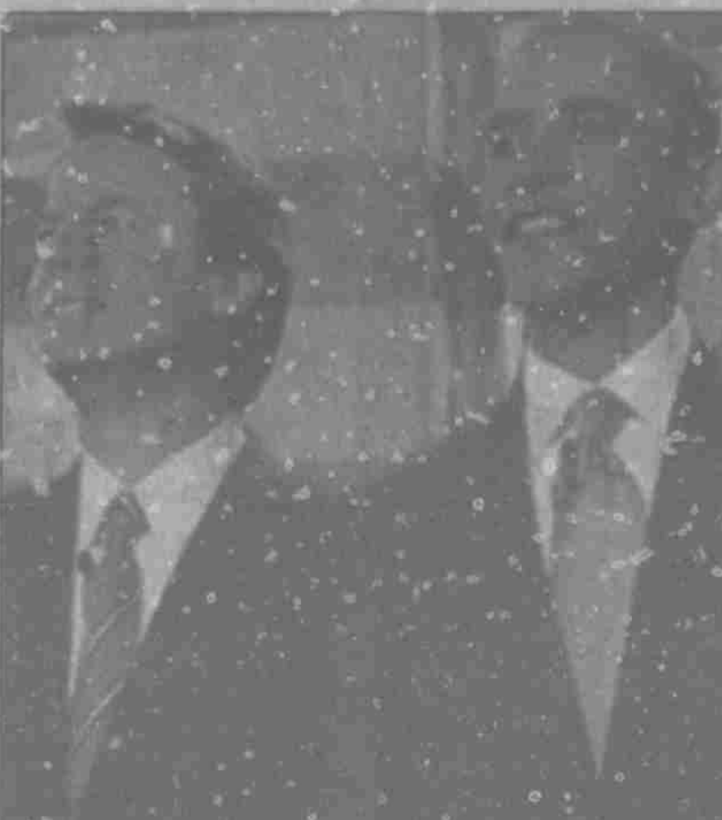
Democrat John Edwards and Senator Barack Obama

Clinton campaign chairman Terry McAuliffe said in a statement, "We respect John Edwards, but as the voters of West Virginia showed last night, this thing is far from over."