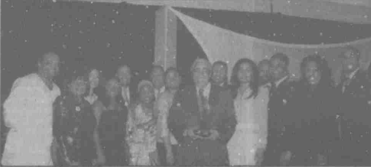
Washington, DC - About 300 people received a strong dose of holistic therapy during the National Coalition on Black Civic Participation's (NCBCP) Eleventh Annual Spirit of Democracy Awards Ceremony held in Washington DC last week. Dinner guests were treated with good food, a mixture of church and gospel music delivered by Pastor Shirley Caesar, and poignant remarks brought by Chairman's Circle awardee Charles B. Rangel, chair, Ways and Means Committee U. S. Congress

Congratulations are in store for the Dunbar Middle School Panther Band and Advanced Band for a job well done. Just think in a few years, the community will hear good things about these young people who did well at the Dunbar Middle School.