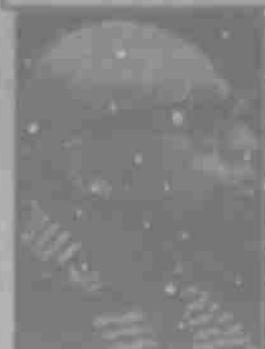
Dr. Maulana Karenga

As an African American and Pan-African holiday celebrated by millions through- out the world African community, Kwanzaa brings a cultural message which speaks to the best of what it means to be African and human in the fullest sense. Given the profound significance Kwanzaa has for African Americans and indeed, the world African community, it is imperative that an authoritative source and site be made available to give an accurate and expansive account of its origins, concepts, values, symbols and practice.