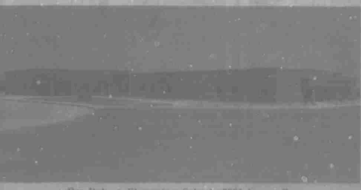
Roy Roberts Elementary School - 7901 Avenue P

If you find mistakes in this publication, please consider that they are there for a reason. We publish something for everyone, and some people are always looking for mistakes.