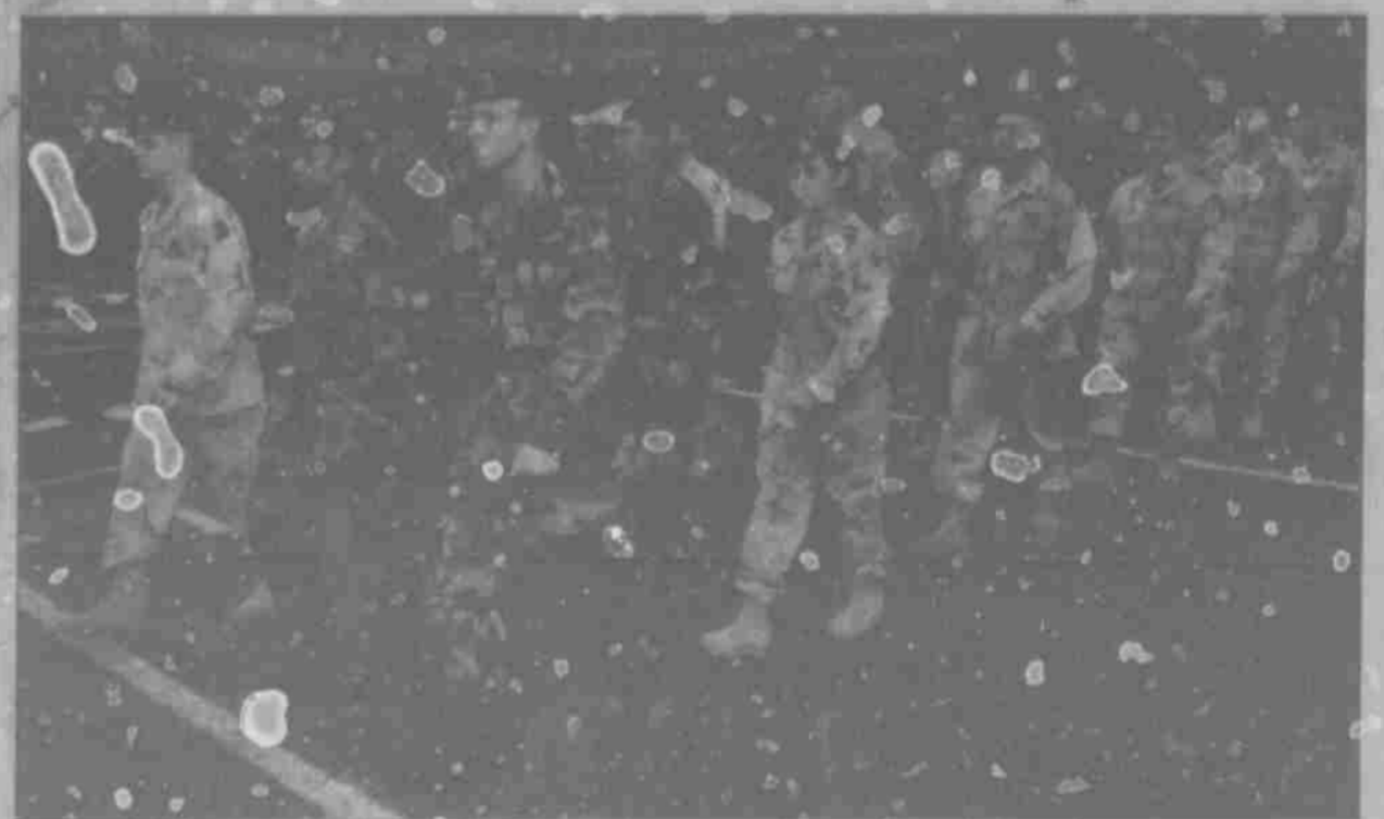
Soldier heroes from various branches of the military were honored for their accomplishments. They are seen here, marching into the Alamodome for opening ceremonies of the "All-American" Bowl.

The theme of this year's game is "Leadership and