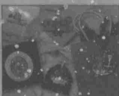
Pictured here are Christmas ornaments from M.D. Anderson's Children's Art Project.

collaborated with the Children's Art Project, producing three new ornaments, the "Ruffled Heart," "Santa Angel" and "Sarah's Angel." The "Gift Heart," "Cow Pig" and "Groovy Hearts" ornaments are still available for sale. These collector's items are painted inside with sterling silver to enhance their vibrant colors. A special Radko signature tag is attached and the ornament is packaged in a signature box for safe-keeping after the decorating season - although these ornaments are perfect to display all year long. The ornaments sell for $40.