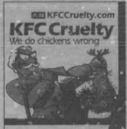
This sticker was part of the content of the "Bucket of Blood" sent to the Southwest Digest from the animal rights group, PETA.

lobbying the NBA to follow suit. He has been interviewed about his animal-protection work on MSNBC, Fox News, CNN, and ESPN and has been featured in The New York Times, The Washington Post, and Sports Illustrated.