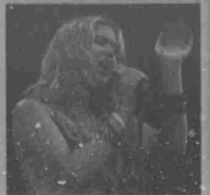
British teenage singer, Joss Stone performed in London. Stone has been compared to Janis Joplin and has won rave reviews from critics and fans.

G8 are leaders meeting near Edinburgh this week, where British Prime Minister Tony Blair has put poverty on the agenda.