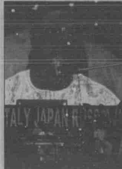
Stevie Wonder, shown here on a huge video screen, performed at the concert in Philadelphia.

The biggest turnout was in Philadelphia, where up to 500,000 fans turned out on US