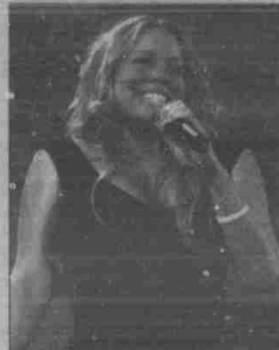
U.S. singer Mariah Carey performed in London. Carey said in an interview that she was afraid she didn't fit in to the rock and roll feeling of the concert. Her performance was a huge success.

US billionaire and Microsoft founder Bill Gates made a surprise appearance. "We can do this, and