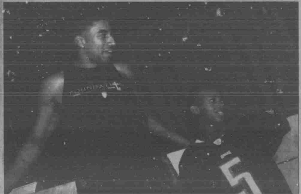
A volunteer and camper play games with the rest of the group at one of last year's camps.

There are sponsorships available for the camp. As mentioned, children who attend these camps do not pay to attend. There is a cost in