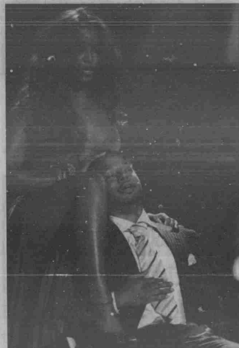
In one of the most memorable performances of the BET Award Broadcast, members of Destiny's Child plucked three men from the audience while they performed Cater 2 U . Shown here is actor Terrance Howard, of the upcoming movie Hustle and Flow with singer Beyonce Knowles. Basketball legend Magic Johnson and actor/rapper, Nelly were also selected for the performance. Johnson clowned and gaped at the display while Nelly relaxed and enjoyed himself. Howard had one of the strongest reactions to the performance. Afterward, some jokingly speculated that Knowles' boyfriend, rapper Jay-Z, would be phoning Howard.