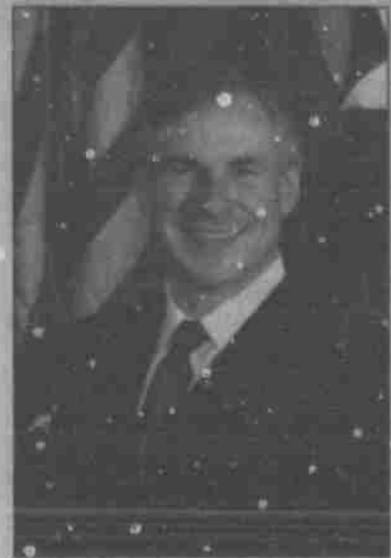
Greg Abbott Attorney General of Texas

The summer is upon us. If you are considering joining a health spa in order to get into shape, you should take into consideration a number of factors. Careful investigation and comparison before joining a health club is key.