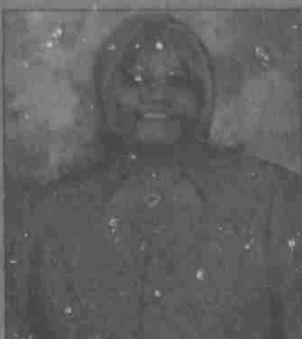
Fashion...Just for the fun of it

with your favorite tee of turtle neck. Remember if you are in stripes...you're in the fashion know!!! Colors- camel, slated gray, navy, channel blue. Fashion tip....Always wear a smile