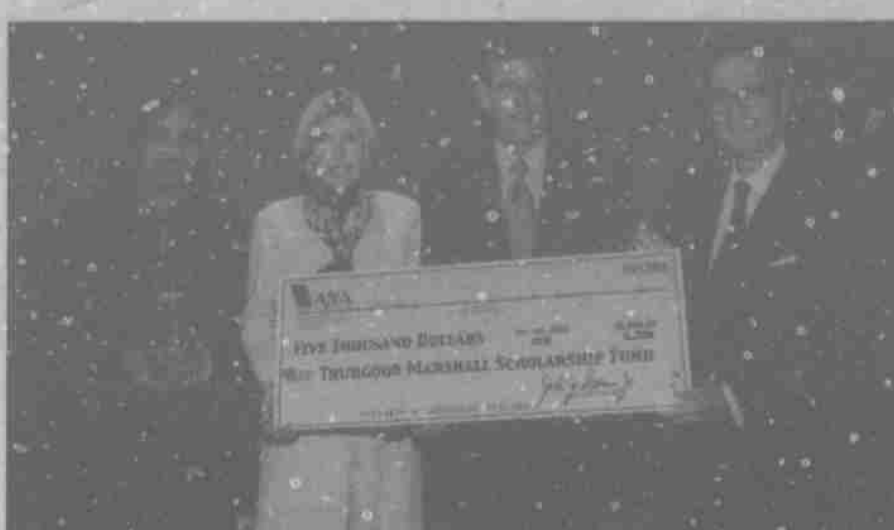
PepsiCo, a winner of the Association of National Advertisers Multicultural Excellence Awards for excellence in Hispanic advertising, receives a $5000 check for the Thurgood Marshall Scholarship Fund which will benefit multicultural students studying marketing and advertising. The PepsiCo family of businesses includes: Frito-Lay, Pepsi-Cola, Quaker, Tropicana and Gatorade.

Her acting credits for feature films include "A Cooler Climate" and "The Horse Whisperer." She also performed voiceover work in "Quest for Camelot." Gilsig was born in Montreal.