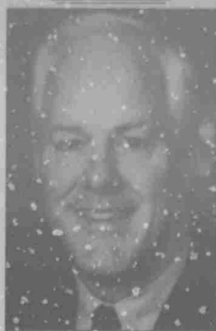
Ask Attorney General John Corryn