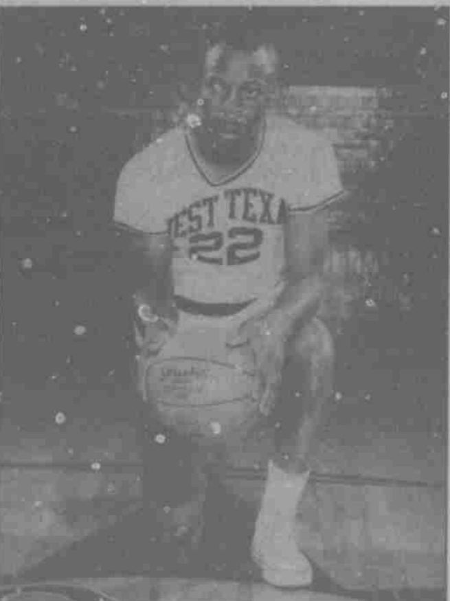
Suited up for the West Texas State Buffaloes