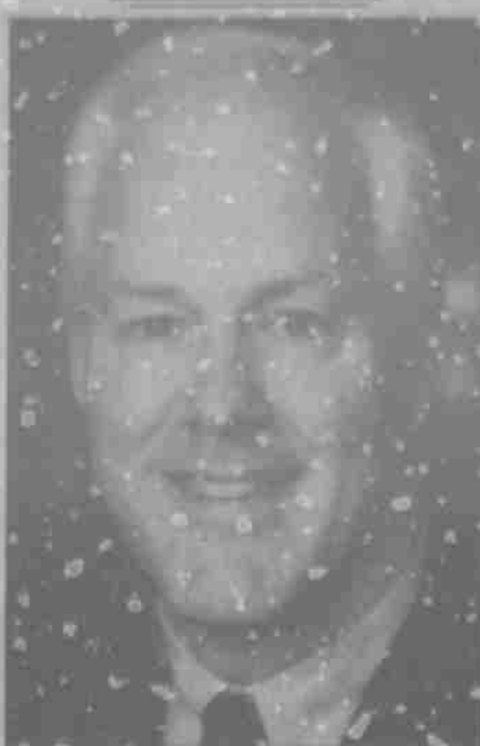
Ask Attorney General John Cornyn

upkeep of common areas such as pools and set up rules about property maintenance. These associations generally have the authority to enforce rules and property covenants. Enforcement measures can include foreclosure on a property.