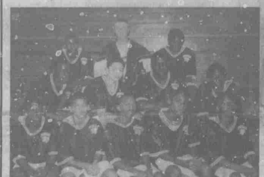
Upcoming Champions in Boys Basketball at the Dunbar Junior High School eighth Grade "A" team are shown to the side.