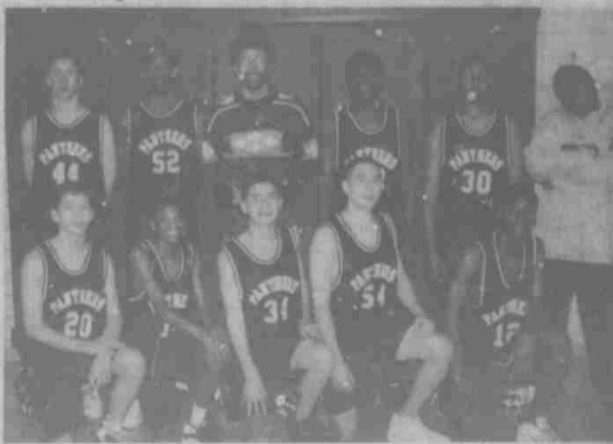
Here are the members of the Dunbar Junior High School Ninth Grade "B" Basketball Team for 2000-2001.