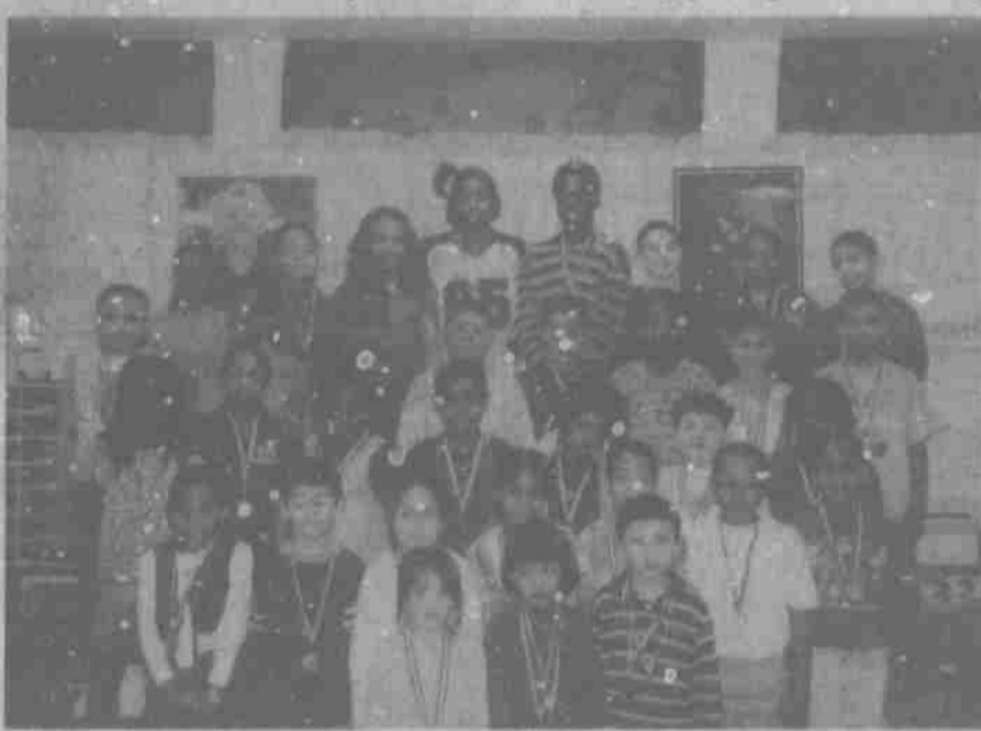
The Ella Iles Elementary School Fine Arts Academy Completed in a gymnastics meet in Shallowater. They won twenty gold Medals, twelve silver