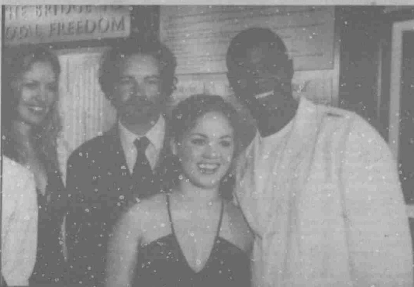
(From left to right) hip-hop legend Doeg E. Fresh; actress Erika Christensen, and Danny Masterson from FOX's "That 70's Show," at the L. Ron Hubbard: A Lifetime of Creativity photo exhibit during a gala opening at the Church's Celebrity Center in Los Angeles, California.

In addition to an Obie Award and the 1992 Special Tony Award for "The Fantastics" Jones and Schmidt are the recipients of the prestigious ASCAP Richard Rodgers Award for 1993. In February of 1999 they were inducted into the Broadway Hall of Fame at the Gershwin Theatre; and on May 3, 1999, their stars were added to the Off-Broadway Walk of Fame outside the Lucille Lortel Theatre.