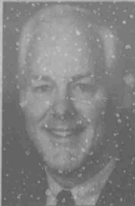
Ask Attorney General John Cornyn