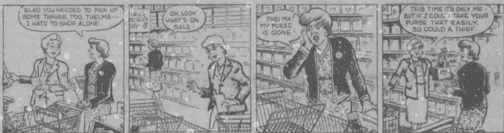
A Public Service of AARP Criminal Justice Services

Sponsored by Southwest Digest & East Side Chapter AARP II 3591, E. 3rd & Oak Ave.