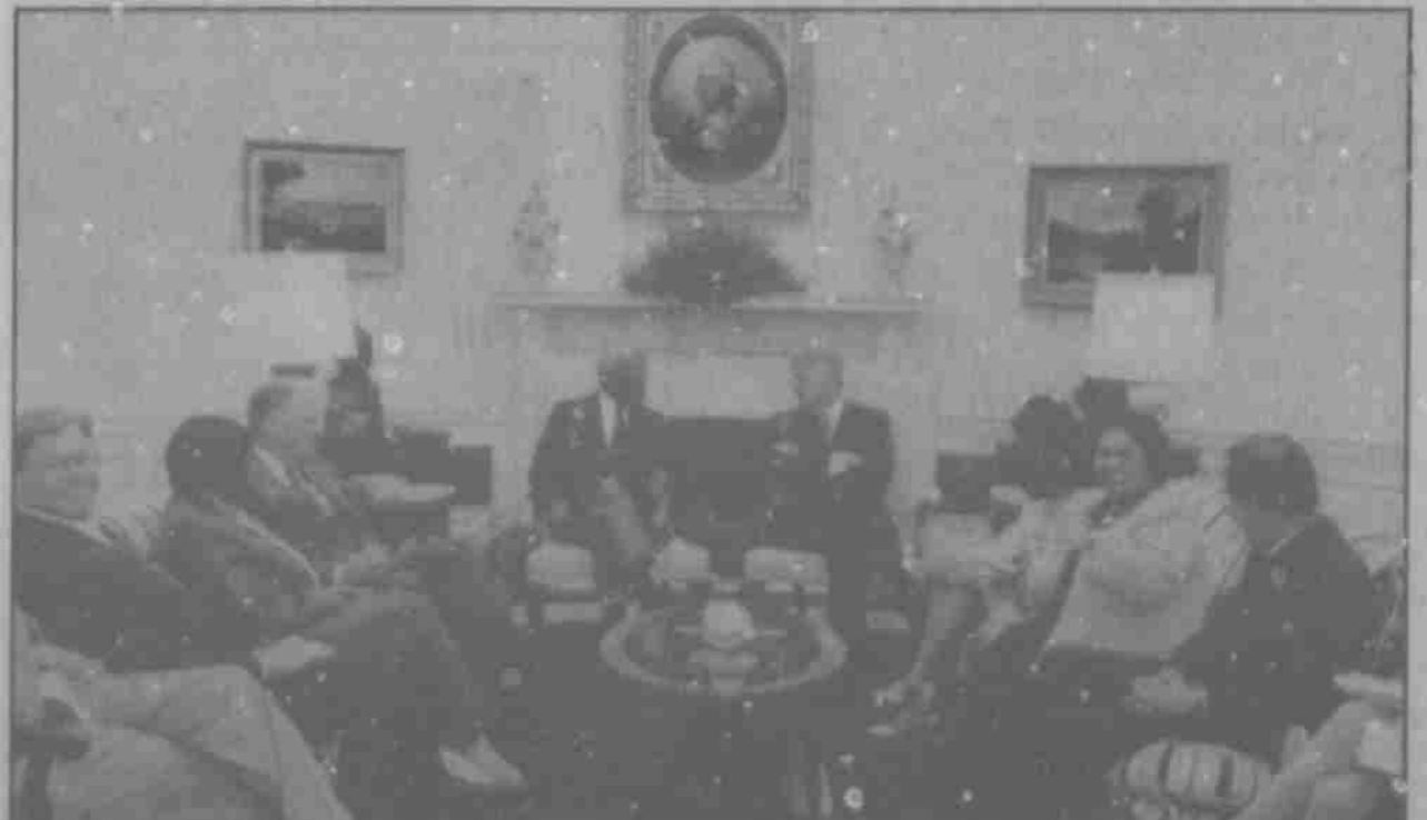
President Clinton held his first meeting with the members of his newly appointed Advisory Board in the Oval Office, Friday, June