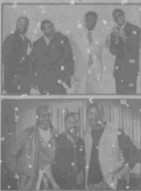
Two of gospel music's hottest groups, Men Of Standard and The Williams Brothers, will perform on the massive Power '98 Tour that will blanket America.

Seldom have two groups had such a positive, major impact on gospel music -- and the five-month tour will continue that trend.