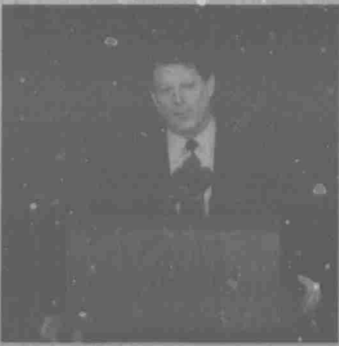
Vice President Gore