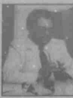
People, to work with them.

The most touching of all was when one person mentioned the black chamber owned housing projects, and a bonded business and the most touching thing was this chamber was organized after the Lubbock Black Chamber, the key to their success was working collectively without personalities, politics, egos and pettiness. The ones of you that can remember the re-organization of the state network was held in Lubbock early 1980's. The meeting to see if there was a want or need to have a state wide organization was held in the Midland-Odessa area from that meeting Lubbock acquired the organization meeting. There was a network charted in Texas which last functioned in 1936. Then looking at the black Chamber in east Texas that's being an asset to the city and community, thinking why this chamber was formed and where it has gone only brings tears to one's eyes the majority of people that sabotaged this chamber was non dues paying members- now we only have some so called black panthers and a couple of parades. We can not beg and bargain at the same time, we have to bring something to the table if it is only a united front. We must put our money, resources, minds, and productivity together for the good of all of us. No one is going to do for us what we must do for ourselves first. If we take the first positive step in a progressive manner, help will surely come but no one and that means no one is in this day and time going to take us by the hand and lead us to the promise land.