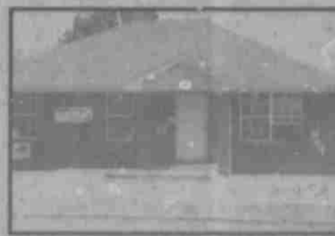
2612 Amherst Stewart Townsen Construction Consultants