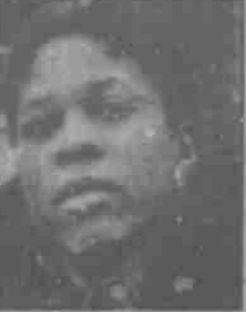
Giuliani's workforce program -- the program in which welfare recipients are required to work to be eligible for their checks. While everyone agrees that the welfare system is a failure and that we have to find ways to move people from welfare to work, the Giuliani program is no solution. However, I'm also concerned about the protest by those groups, who have refused to accept workforce workers that the city wants to place in their agencies.