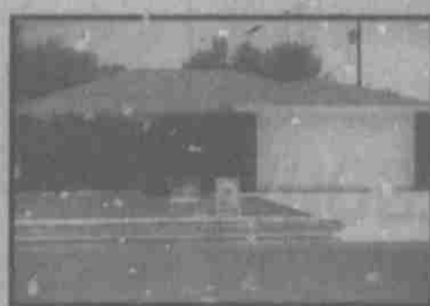
2610 Amherst Joe Stettheimer Heritage Homes