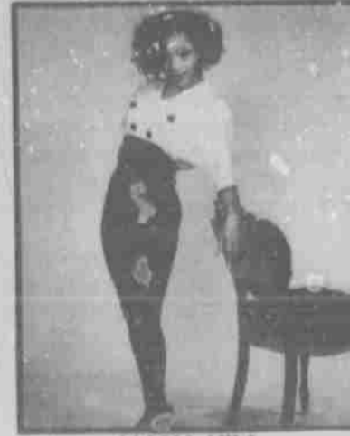
ALICIA HILL National Stage Actress