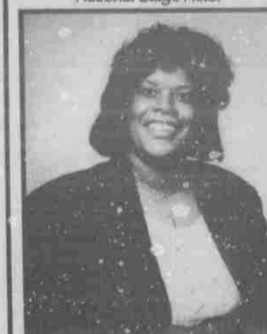
CECELIA DANIELS National Stage Actress