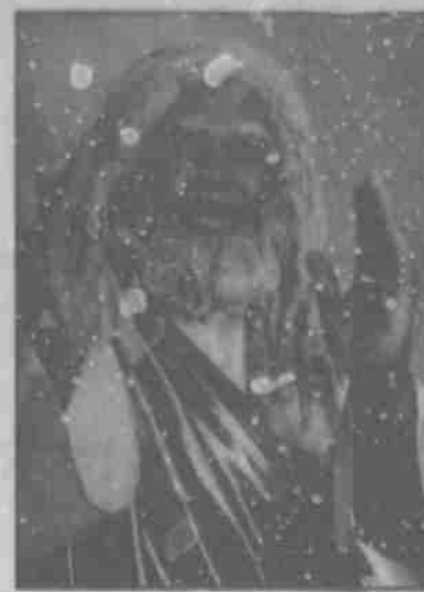
Special Appearance By JESUS

We wish to express to the community that the same caring service that was rendered in the past will continue in the future.