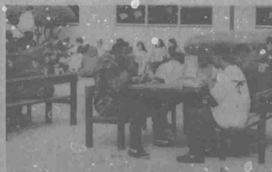
LUNCH TIME AT EHS! If you could go to Estacado High School, during the noon hour, this is what you would probably see. These young people are enjoying their noon meal.