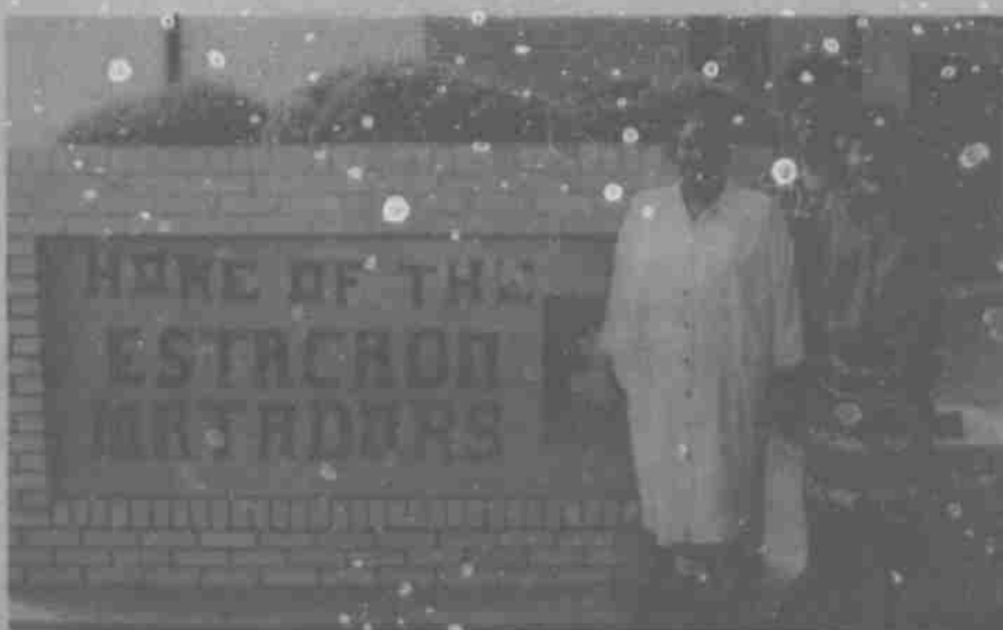
COME AND VISIT OUR CAMPUS! These young African-American Sisters appear to be inviting the public to come and visit their school, Estacado High School.