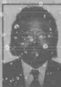
Gerald D. Jackson Office & Funeral

In your hour of bereavement when you want the best for your love ones, but are not able to meet the requirements for a service above your economic means, maybe this is the answer for you: