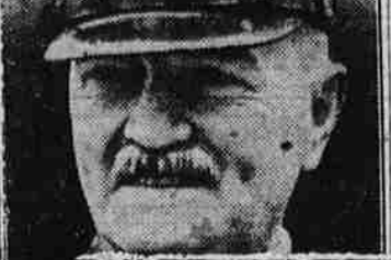
This is a recent picture of Gen. John J. Pershing, who observes his seventy-second birthday on September 13.

Reservations for seats at the program of Thursday evening. The new building will be open for public inspection from Wednesday noon to Thursday noon. It then will be closed to make preparations for the opening, but will again be open for inspection following the program which will begin at 7:30 Thursday.