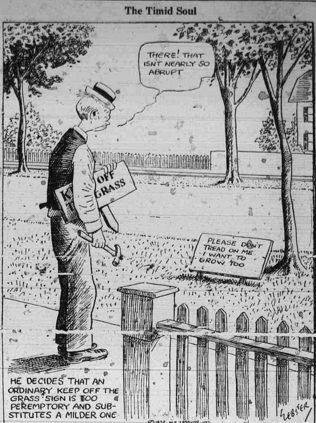
HE DECIDES THAT AN ORDINARY KEEP OFF THE GRASS SIGN IS TOO PEREMPTORY AND SUBSTITUTES A Milder ONE.

Why should it matter That behind my door I keep a rainbow Tied to the floor? They are the queer ones With their jealous eyes; I gho talk with wood and sky Am very very wise.