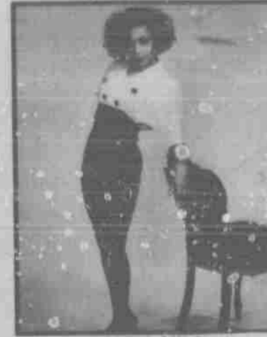
ALICIA HILL National Stage Actress