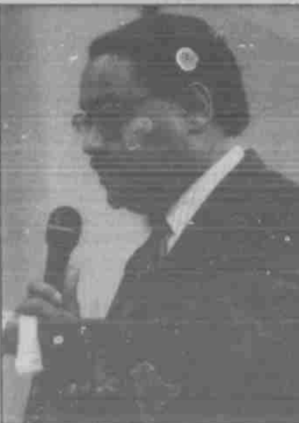
SENATOR RODNEY ELLIS

A proposal by Senator Rodney Ellis to integrate the Texas judiciary was left pending in a Senate committee this week due to opposition from Republican lawmakers.