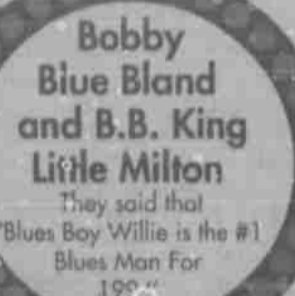
Bobby Blue Bland and B.B. King Little Milton They said that "Blues Boy Willie is the #1 Blues Man For 1994"

CoCo Inc. Presents The Best Of Entertainment REVIEW