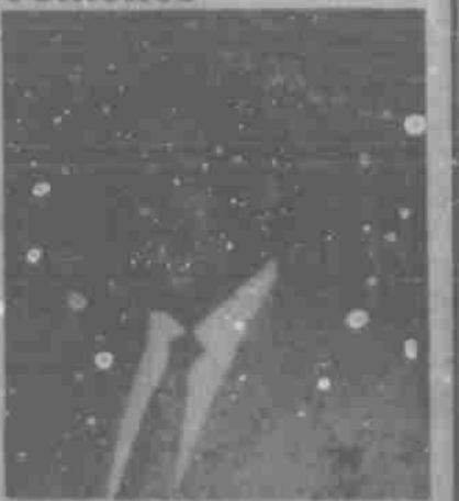
Ossie B. Curry