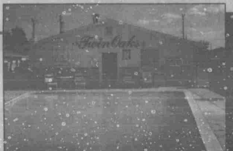
Twin Oaks • 792-2738