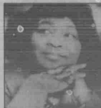
Dr. Betty Shabazz