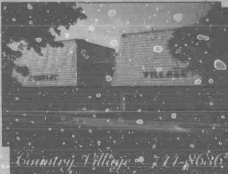
Country Village • 741-8686