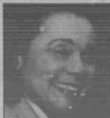
Coretta Scott King