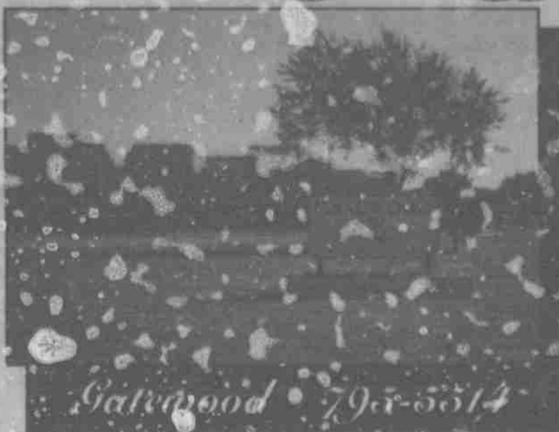
Gatewood • 792-5514