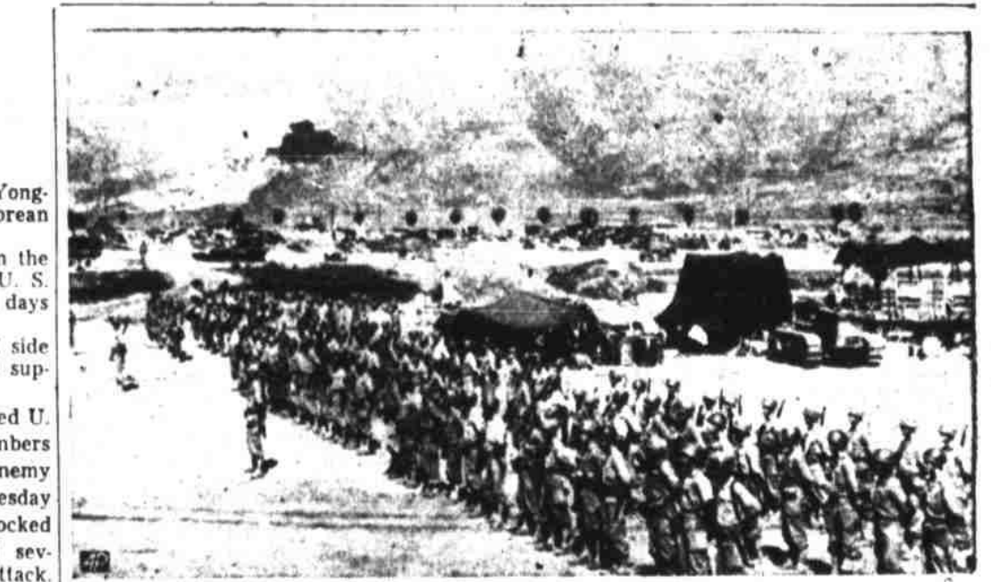
MARINES AWARDED PURPLE HEARTS—U. S. Marines line up near Masan, on the Southern Korean front, last week for ceremony awarding 82 Purple Heart decorations to leathernecks in the Korean war's largest decoration ceremony. The Korean Republic's President Syngman Rhee flew to the front to witness the awards.

WASHINGTON, Sept. 6.—Secretary of State Acheson said today it is highly desirable to find an appropriate way for Germany to aid the defense of western Europe. He also told a news conference the meeting of the western foreign ministers at New York next week will cover almost every major world problem. Acheson further said that the defensive preparations in the Atlantic area have reached a stage where plans must be speedily translated into action. He said it is time now to get the actual men, equipment and command structure so that defense forces will be adequate. In discussing Germany's future defense role, Acheson backed up the statement of John J. McCloy, high commissioner for Germany. McCloy said at the White House yesterday that the Germans should be enabled, if they so desire, to defend their own country. Acheson said McCloy was stating a very obvious and proper objective. The secretary added that our current purpose of strengthening the forces of western Europe is to protect the whole area, including the German people from aggression. Therefore, he added, it is highly desirable to find an appropriate way by which Germany can contribute to the defense of western Europe.