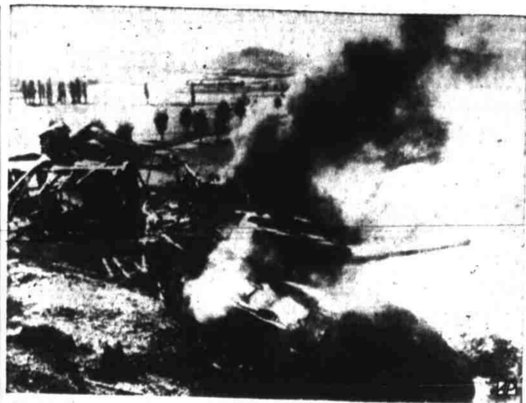
RED TANKS KNOCKED OUT —Two Russian-made T-34 tanks are shown burning beside a shattered building after being hit by American fire during recent action in the Yongson area of South Korea by U. S. Marines and Second Division infantrymen. Yongson is 32 miles south of the communications center of Taegu. The Reds in the area were driven back toward the rain swollen Nakdong river.