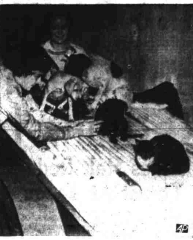
ALL ACCOUNTED FOR —Rescue workers didn't overlook family pets when high Gulf tides driven by gales caused havoc along Florida beaches. At Madeira Beach near St. Petersburg the Red Cross bedded down these soggy dogs and a cat on a cart loaded with fire hose. The rescue workers are unidentified.