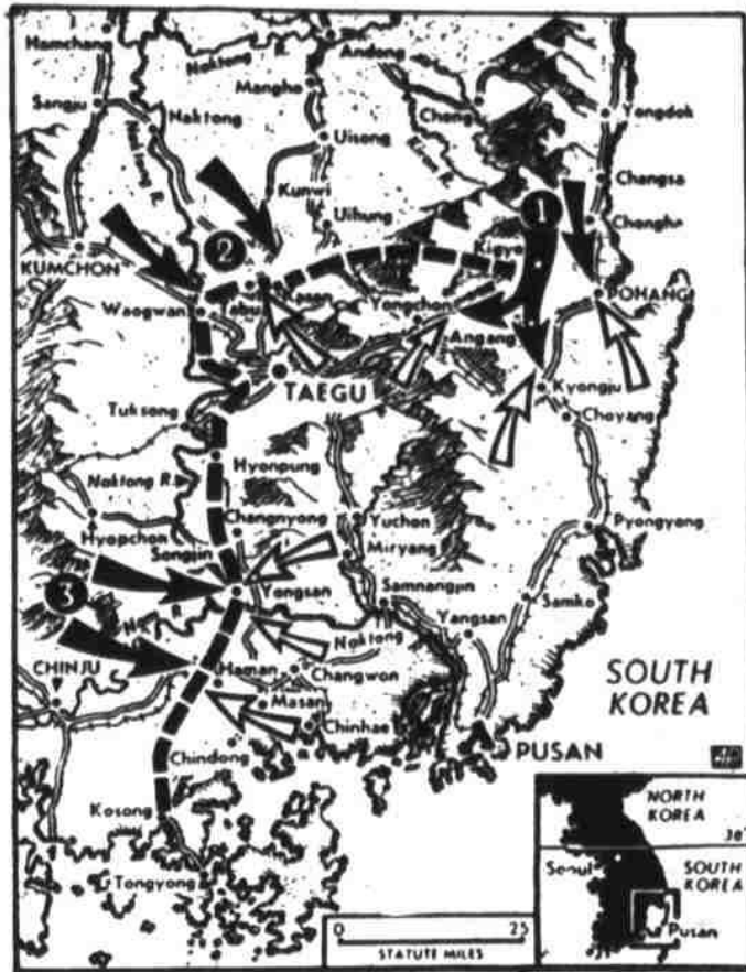
REDS THREATEN TAEGU FROM THE EAST—In a new menace to Taegu from the east, North Korean Reds (1) attacking from south of Kiyje have been checked five miles north of the junction city of Kyongju. However one prong of the attack has swung west in the direction of Yongchon, main highway junction 20 miles east of Taegu. Pohang is also under attack. North of Taegu (2) U. S. troops pulled out of Kasan. In the south (3) Yanks continued to push against the Reds west of Yonosan and hit at Communists west of Masan. (AP Wirephoto Map)