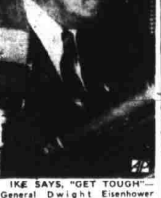
General Dwight D. Eisenhower (above) is shown as he delivered a nationwide radio broadcast from Denver launching the Crusade for Freedom. "We must get tough—tough with ourselves," he said in calling for "Spartan frugality" in the battle against the spread of Communism.

NEW YORK, Sept. 6. — Peace talks begin tomorrow in the CIO-General Electric Company strike — now more confused than ever.