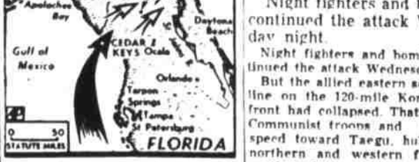
WHERE HURRICANE HITS FLORIDA—The dark arrow shows the path of a hurricane which moved up the west coast of Florida and thrust inland at Cedar Key. The storm is moving northeastward and is expected to take a path (open arrows) across the rich citrus belt toward the Jacksonville-St. Augustine area. The weather bureau reported winds rising to 125 miles an hour in the storm. Hurricane warnings have been hoisted north of Daytona Beach, Fla., to Savannah, Ga. (AP Wirephoto Map)

MIAMI, Fla., Sept. 6.—The tricky Gulf hurricane which caused two deaths and left more than 400 homeless whirled in dying fury near the Tampa Bay area today. The Miami Weather Bureau said it was centered a short distance north of Tampa and was losing intensity. The 6 o'clock morning advisory reported it was doubtful if there were any more hurricane winds in the storm which earlier lashed the middle Florida Gulf Coast with 125-mile per hour gusts. At the same time the weather bureau warned of squalls over northern and central Florida and said there would be dangerous gales in the west central part of the state. High tides were expected from the Tampa Bay area southward and on the Atlantic Coast from St. Augustine to Savannah. The hurricane doubled back and headed south after falling all day yesterday in the Cedar Key area, where the greatest damage was reported. Aid was rushed to the stricken Cedar Key where Florida Highway Patrol Capt. Olin Hill estimated between 400 and 500 were homeless. A convoy of six trucks left Turner Field at Albany, Ga., with C and K rations for 800 persons. See HURRICANE, Page 9, Col. 3 See TANK, Page 9, Col. 3