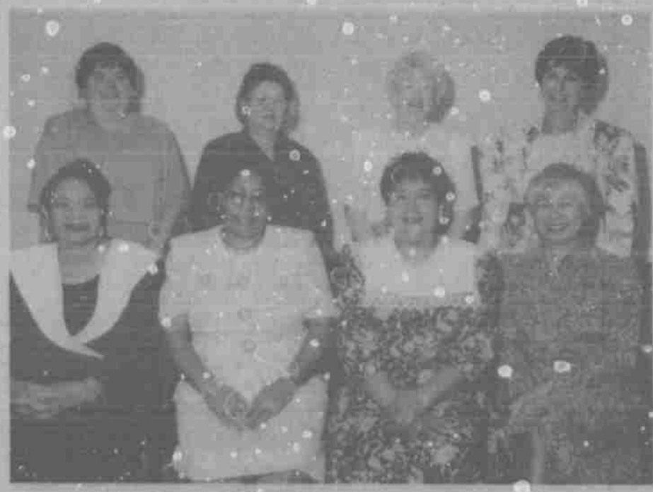
Extra Mile Recipients—1993

The 1953 Extra Mile Awards & Reception will be underwritten by Dimensions of University Medical Center.