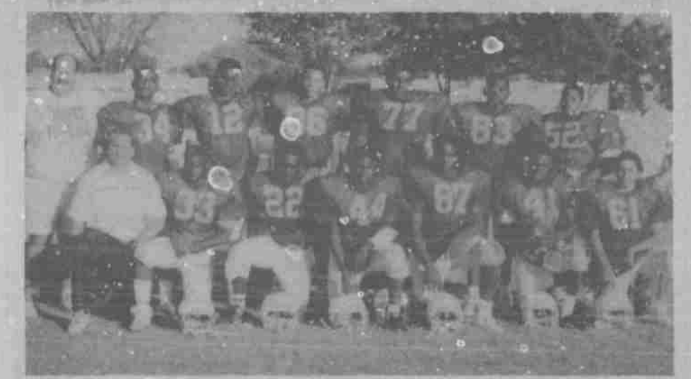
ALDERSON UNDEFEATED SEASON. Pictured above are members of the 8th Grade Strong team who is in first place. They defeated Evans 30-6