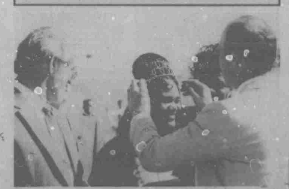
"Here She Is, Miss EHS 1993!"

"The way you provide good care, whether it be trauma care, pediatrics, obstetrics or anything else, is through the talent, commitment and teamwork of the people who work in those areas. We wouldn't be a Level I trauma center if it weren't for the peop® because they're the ones who truly do the work and provide the service," he said.