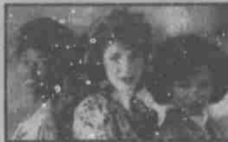
An evening with Elect Lady