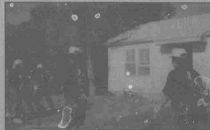
Original house of Ernest Butler