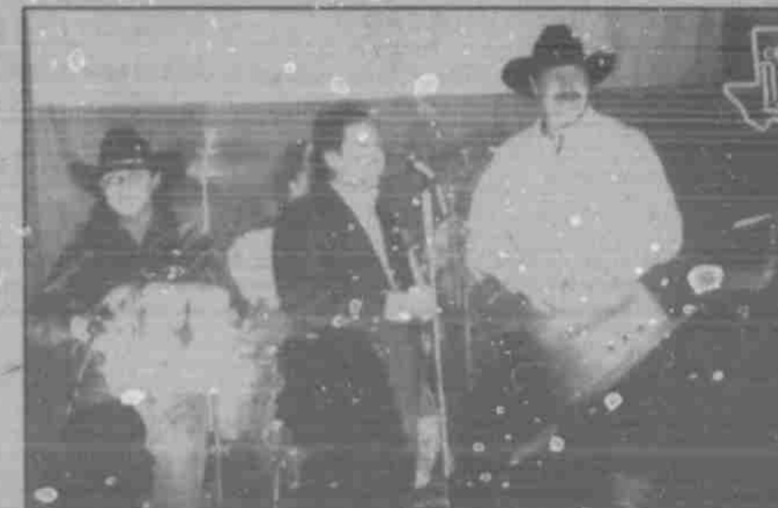
He Can Act, But Can He Sing?