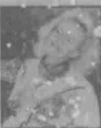
Chonda Pierce "Southern Gospel Humor"

"More Hit Songs Than Any Other Gospel Group"