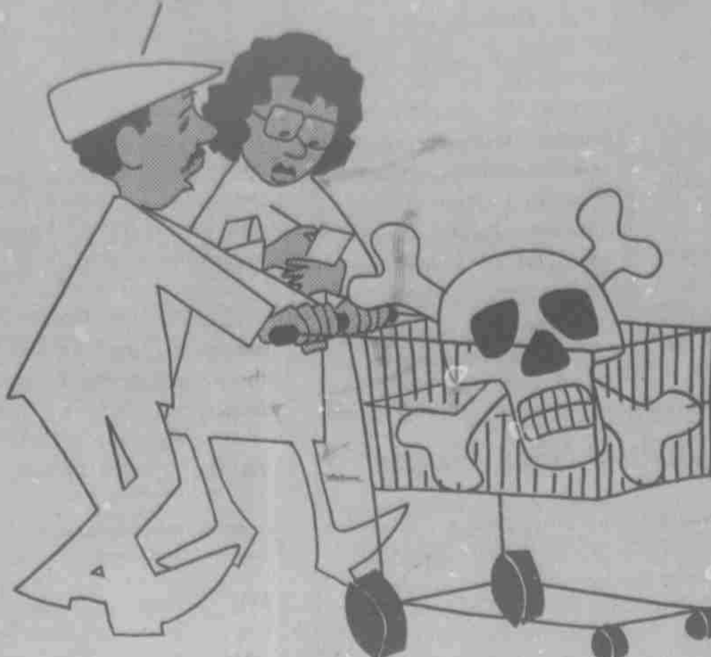
BRANDON JR. BLACK RESOURCES INC.