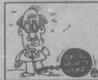
America's seniors are fighting for the freedom to work.