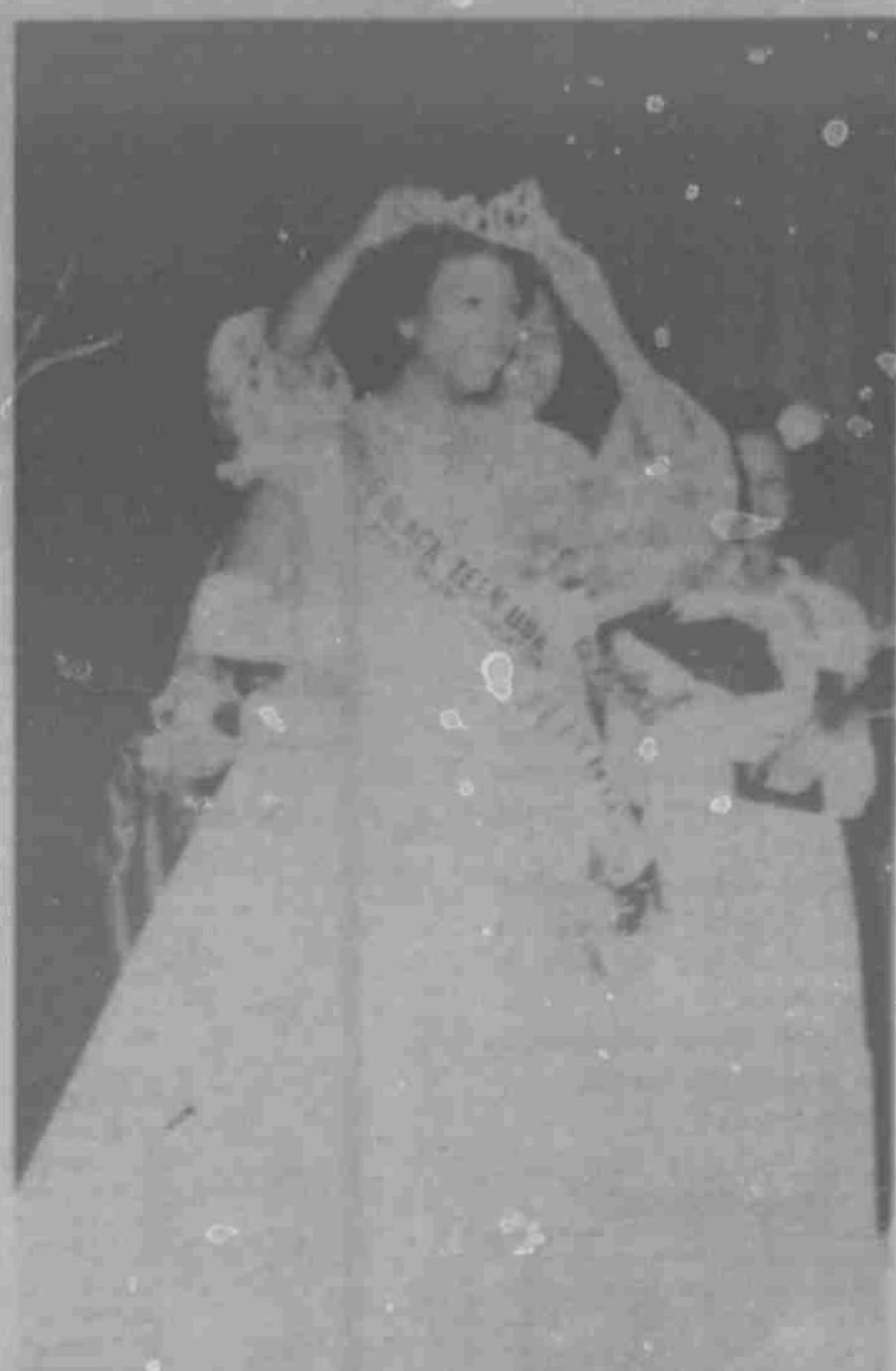
Seeking Contestants For Young World Talent