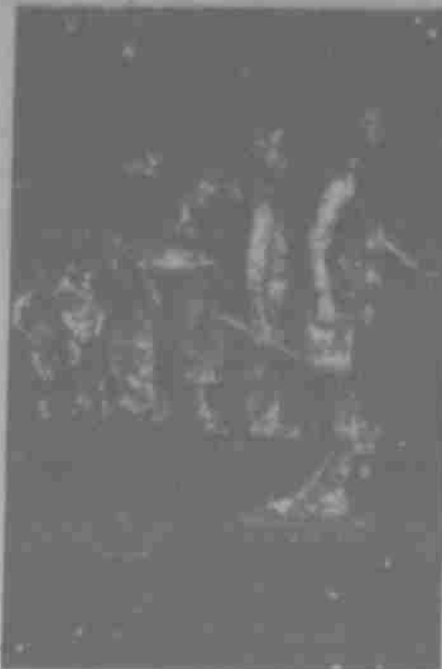
"EVOLUTION OF A PEOPLE," by sculptor Ed Dwight.