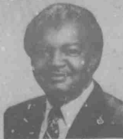
FROM THE OF PARSON D. A. SMITH

The public is cordially invited to come out and participate in those activities.