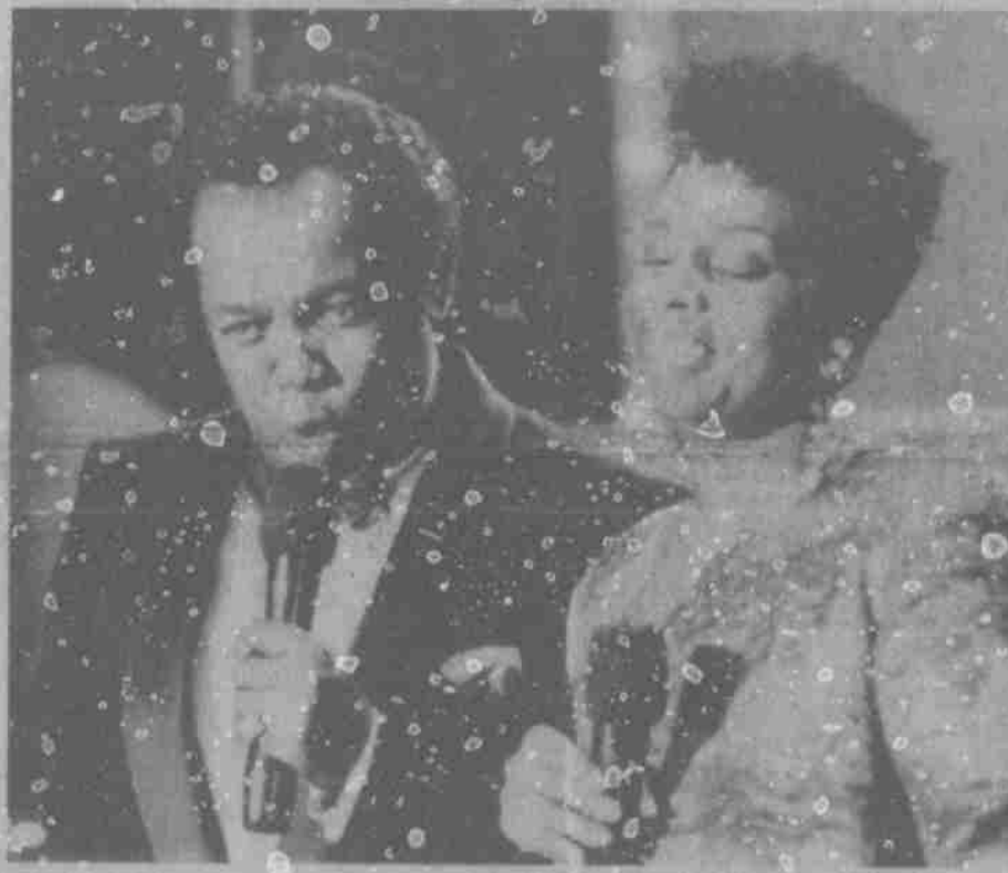
Lou Rawls & Dianne Reeves

Hollywood -- The "Lou Rawls Parade of Stars" telethon, which benefits the United Negro College Fund (UNCF), will celebrate its tenth anniversary on Saturday evening, December 29, 1989 when the seven-hour special is broadcast nationally.