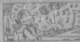
Wolfgang Amadeus Mozart played the harpsichord when he was only three and wrote a symphony when he was eight-years-old.

Bank, the Lubbock Symphony Orchestra, St. Mary's Hospital and the Lubbock Science and Technology Center.