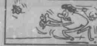
People believe if you catch a falling leaf, you will have a good and happy life.