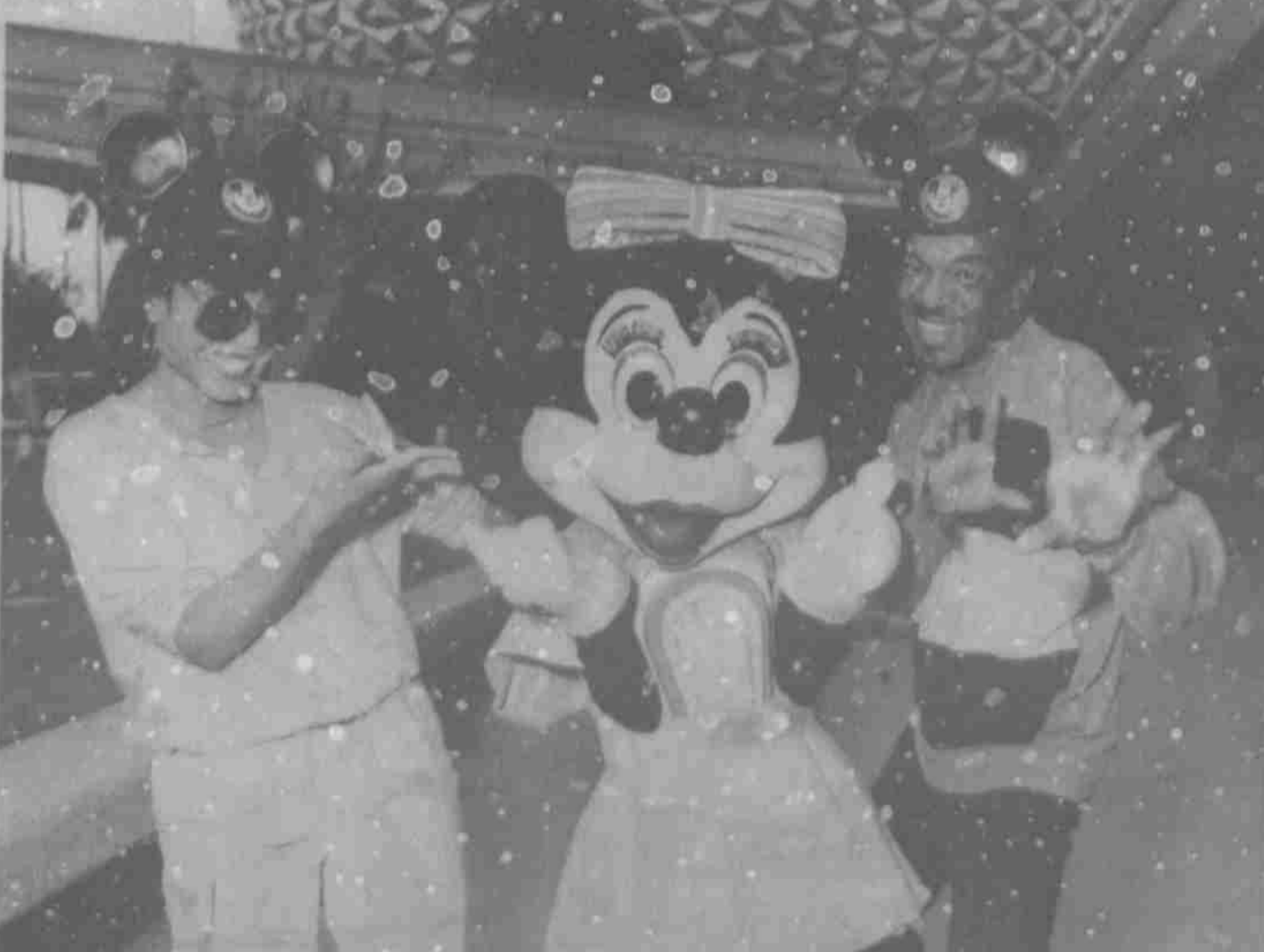
Platters On A "Minnie" Tour -- Noise Whitaker and Paul Robi, members of the rhythm and blues group, "The Platters," serenade Minnie Mouse during a recent visit at Walt Disney World Epcot Center. The group was in Central Florida for a live-night performance. Robi, the only original member still with the group, said The Platters had just finished a tour of South America and China.