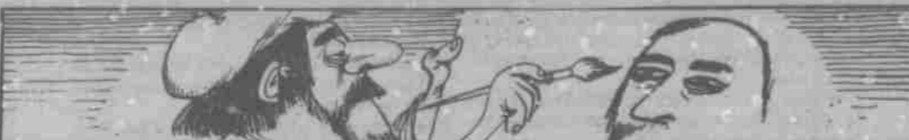
A cartoon is so called from cartone an early word for cardboard on which they were drawn centuries ago to serve as models for large works of art or craftsmanship.