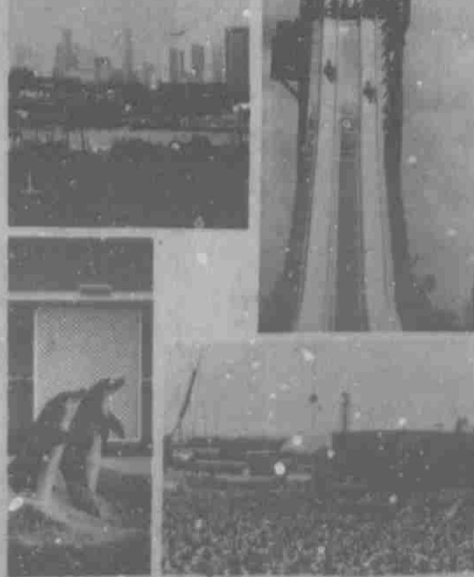
HOUSTON, TEXAS...Summer travelers heading to Houston can enjoy the AstroWorld/WaterWorld Entertainment Complex daily through Sept. 1, except Mondays at AstroWorld. Vis-tors will find a host of attractions including: Excalibur (upper left), Wipe-Out (upper right), a trained dolphin dip in Aquafrolics (lower left) and top-name entertainment at Southern Star Amphitheatre (lower right).