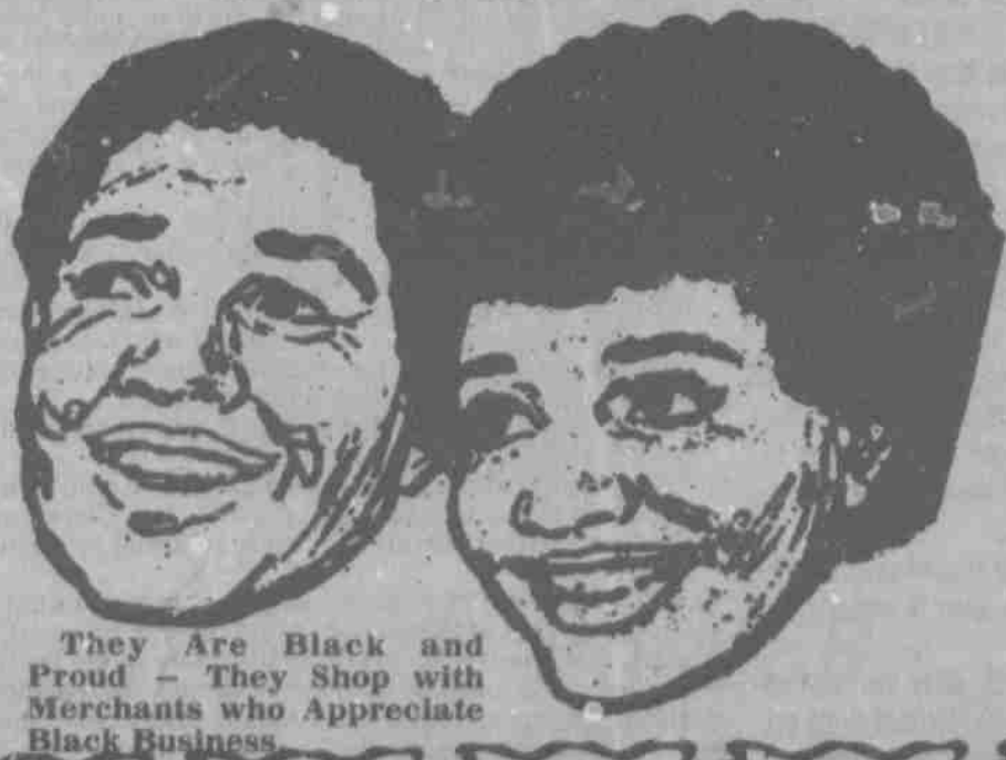
They Are Black and Proud - They Shop with Merchants who Appreciate Black Business

Wig sale Wig Trend 1012 Broadway 763-1106