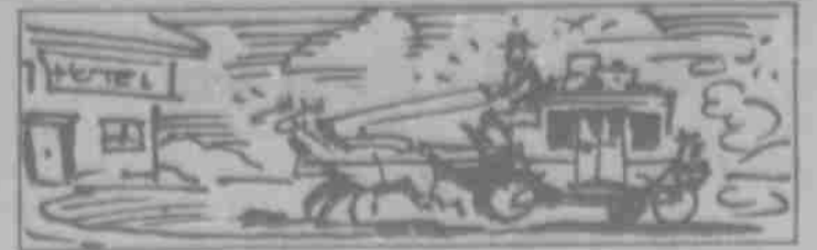
Abolitionist Ellen Craft escaped from slavery disguised as a white man. She and her husband traveled from Macon, Georgia to the North, staying at the best hotels along the way. They later traveled to Europe, as themselves, speaking in favor of abolition.