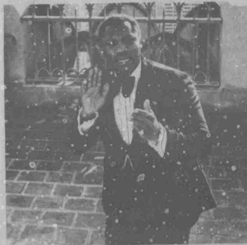
Joe Frazier - 1971 World Heavyweight Champion.