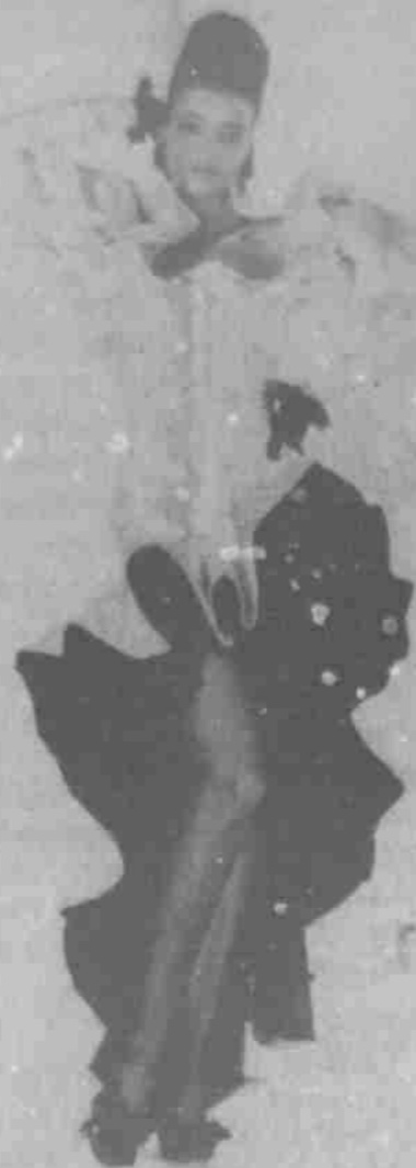
The majestic allure of yellow satin in an emanuel ungaro gown is the black satin lining in the stand-up

Cage enjoys sports, reading, listening to music, meeting people, and attending church.