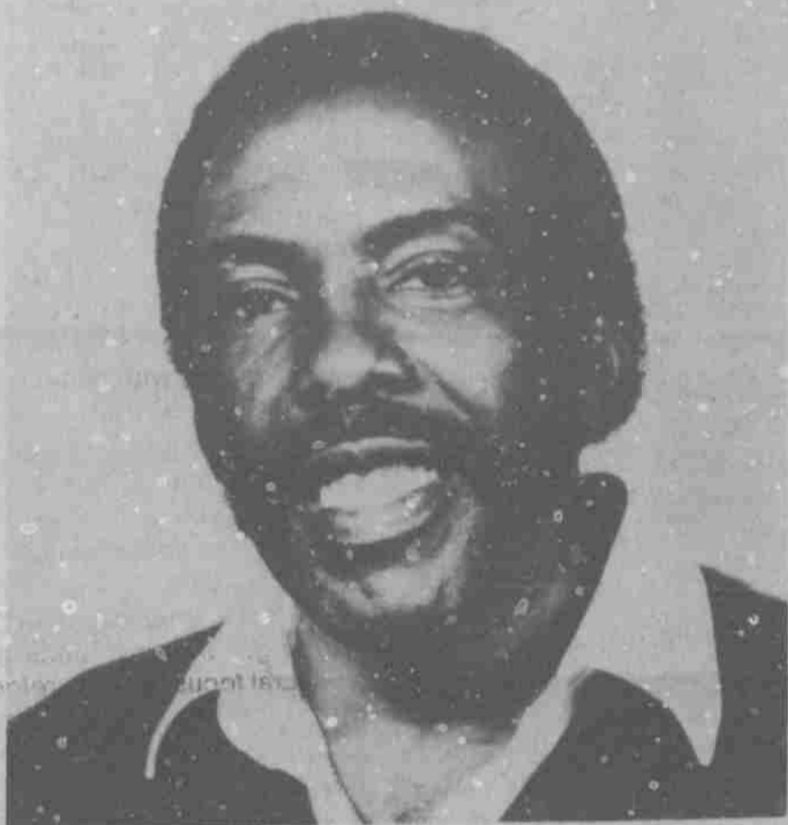
Calvin Peete - winner of 11 P. G. A. tournament.