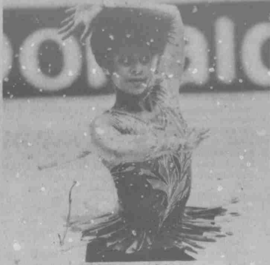
Debi Thomas - U.S. figure skating champion.