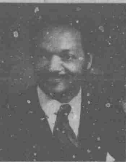
Jesse L. Jackson

The citizens of the Black Community of Lubbock and West Texas are very proud of Rev. Jesse L. Jackson as he stood tall in the saddle in Super Tuesday in Texas this week.