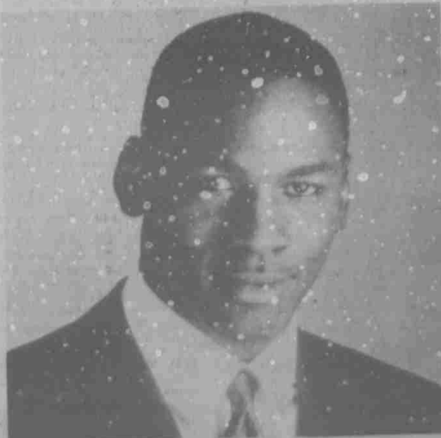
Michael Jordan - talented Chicago Bull and MVP of 1988 All-Star Game.