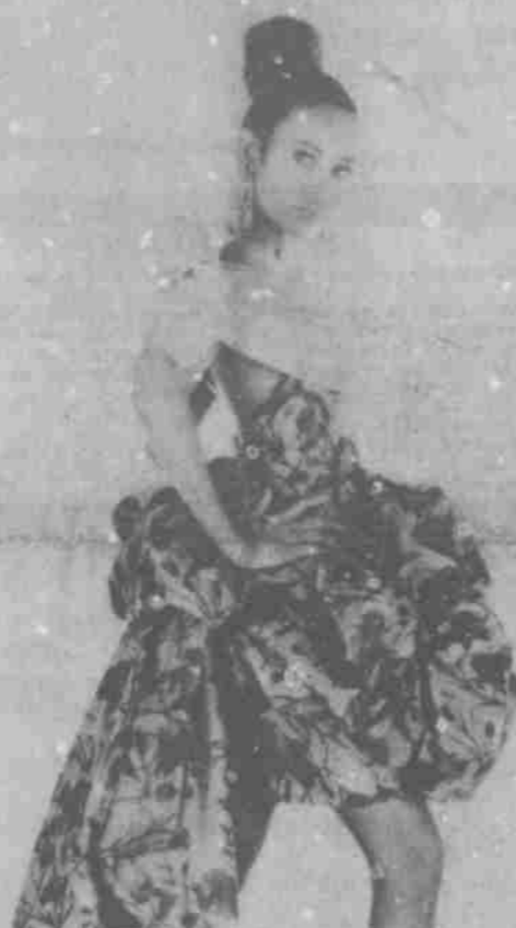
Exotic Christian LaCroix gown in orange silk taffeta