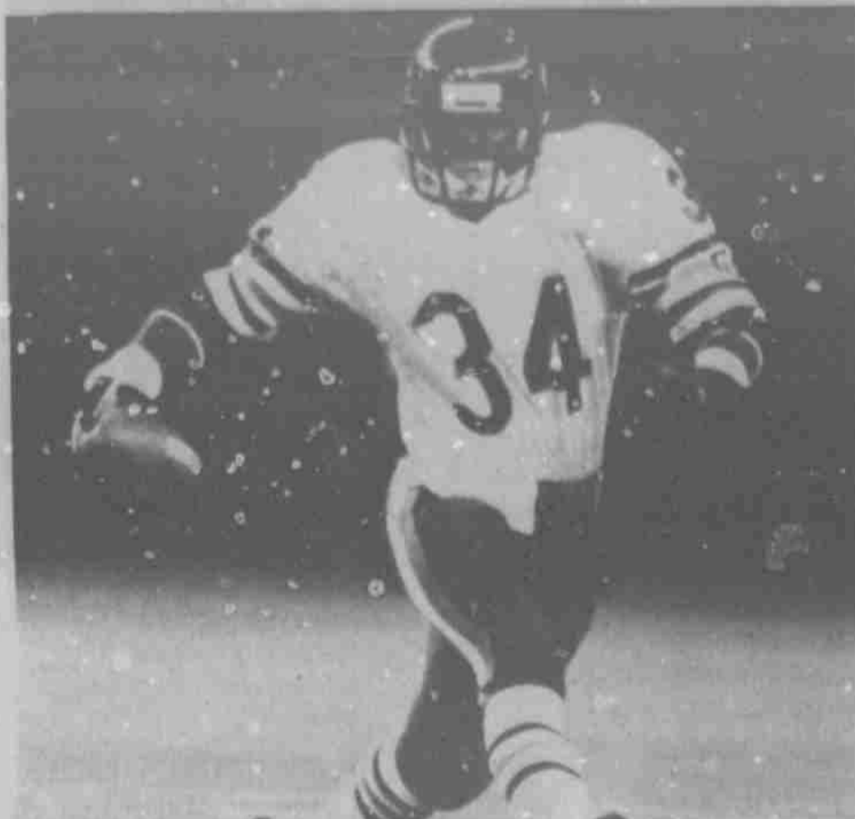
Walter Payton - outstanding former Chicago Bear.

Awards Banquet is co-sponsored by Miller Brewing Company and Coca-Cola.