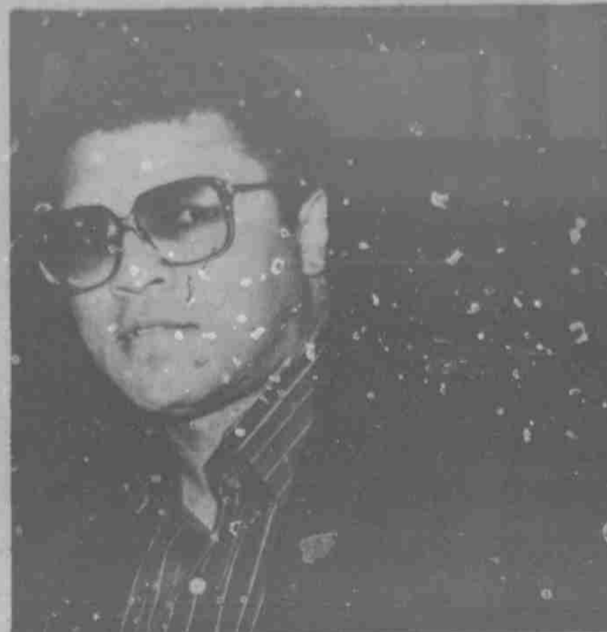
Muhammed Ali - three-time World Heavyweight Champion.