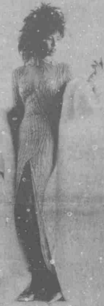
Superb gold beaded gown designed by Bob Mackie has