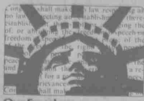
Our Freedom Safeguards Your Freedom