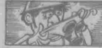
Originally, facial tissues were to be used as filters for gas masks during WWI.

Neighborhood meetings provide the opportunity for participants to identify specific needs and preferences in regard to programming.