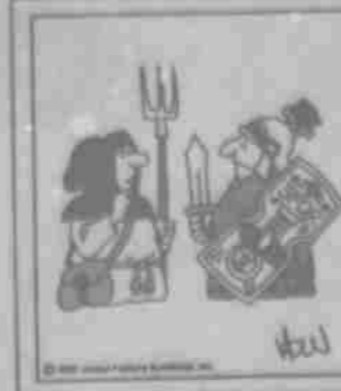
I DON'T RECALL WINNING A "CONQUEROR WANTED" AD.