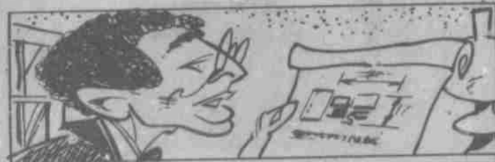
Black inventor Andrew J. Beard was awarded $50,000 by the U.S. in 1897 for inventing the railroad coupler.

The fact that you mailed a letter to me indicates motivation, reasoning ability and a certain sense of self-worth.