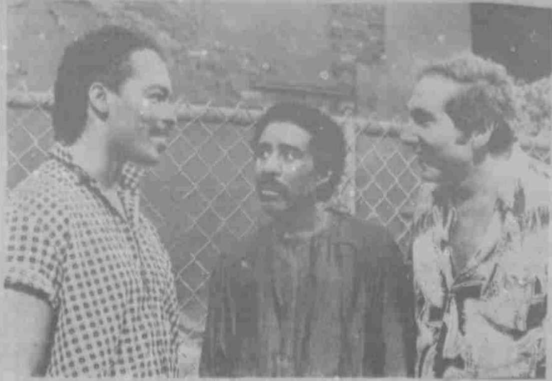
Ray Parker Jr. has topped the popular music charts over the past several weeks with his big hit record "Ghostbusters". He has since been signed by producer, Marty Krofft, to write and perform the theme song to "Pryor Place", a 1/2 hour live action children's television show which airs