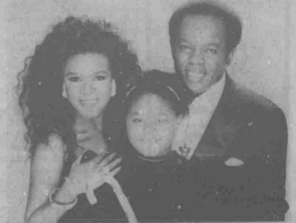
Angela Winbush, Countess Vaughn, Lou Rawls