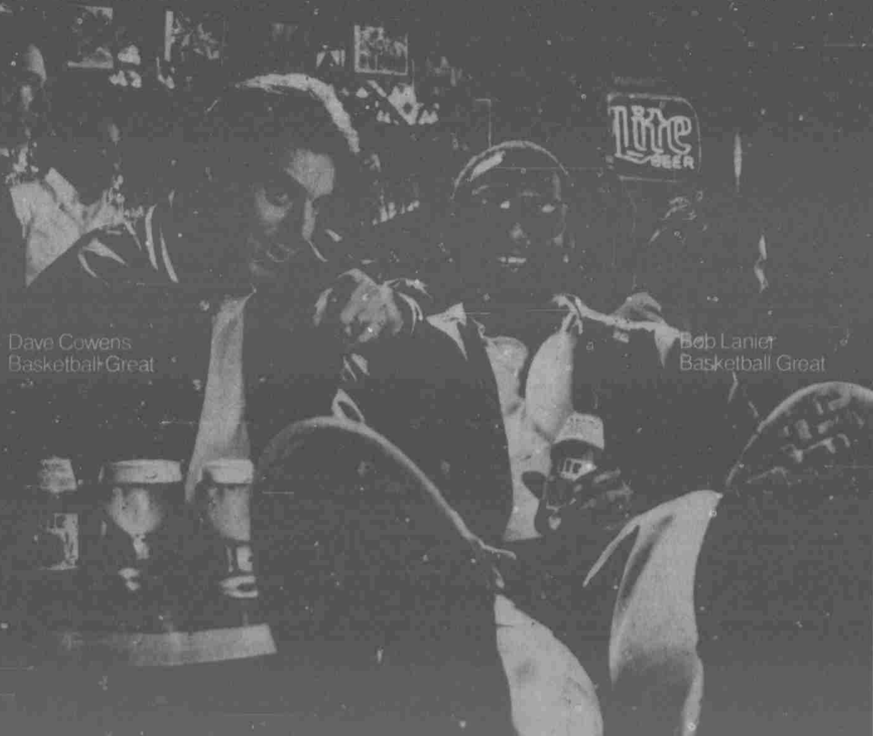
Dave Cowens Basketball Great

"LITE'S TASTE IS THE BIGGEST THING I'VE RUN INTO SINCE BOB'S SHOES."